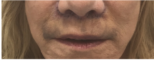
One Week After