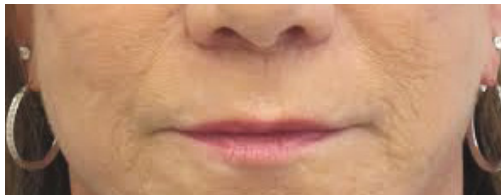
Six Months After