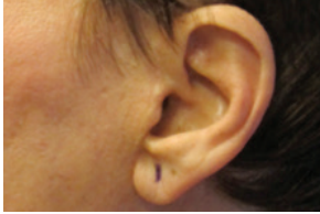
After: Six Weeks Post Repair