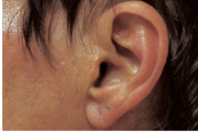
After: Ear Piercing