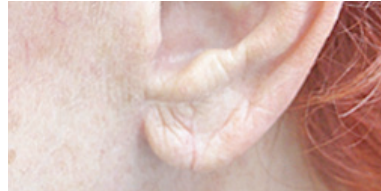
After: Ear Piercing